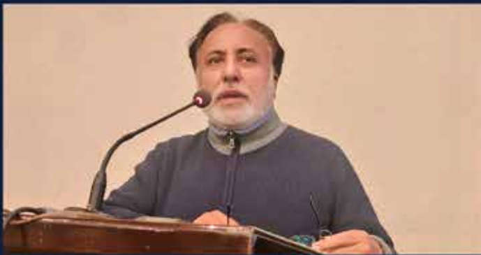
پروفیسر ڈاکٹر مستنیش علوی تحقیق کا قرآنی منہج کے موضوع پر منعقدہ سیمینار سے خطاب کر رہے ہیں۔