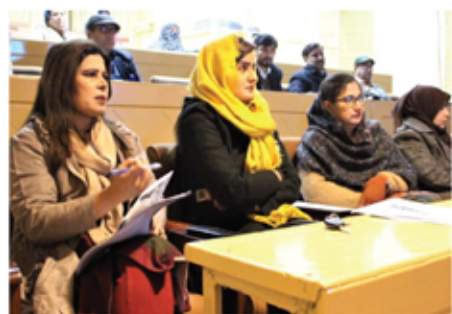
Senior Faculty members attending the workshop.

The Department of Psychology and the Counseling Centre of University of Sargodha organized various training workshops for the teachers and the students to promote emotional and psychological wellness for teachers, and to address strategies for fostering collaborative learning among students to promote deep learning. The workshop was attended by teachers from Govt Ambala Muslim College Sargodha, the Department of Education, and the Department of Psychology, as well as faculty members from the University of Gujrat and Fatima Jinnah Women University Rawalpindi, who joined through an online link. Speakers emphasized the importance of collaborative learning and the need for teachers to develop innovative strategies for managing, assessing, and evaluating collaborative activities. They also highlighted the need for a culture of peer tutoring, student-led teaching and stressed the importance of emotional and psychological well-being for teachers and the need for continuous emotional and professional development.