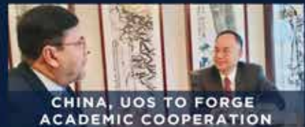
CHINA, UOS TO FORGE ACADEMIC COOPERATION

TECH GIANT I2C INC TO SETUP STATE OF THE ART INCUBATION CENTER