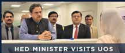
HED MINISTER VISITS UOS

MOU WITH ICCBS KARACHI TO ADVANCE SCIENTIFIC RESEARCH