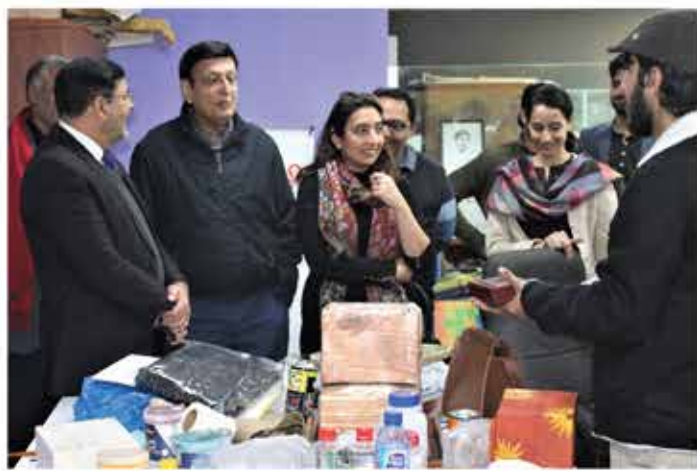
"Freelancing experts visiting regional plan 9 office at UoS."